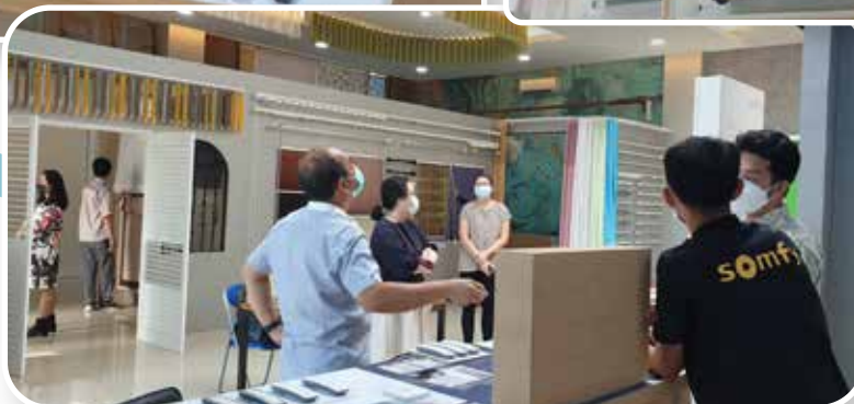
Location: Jakarta, Indonesia Customer: Sumber Prima